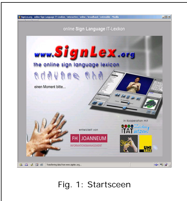
Fig. 1: Startscreen

www.SignLex.org is the online sign language lexicon of IT related terms.